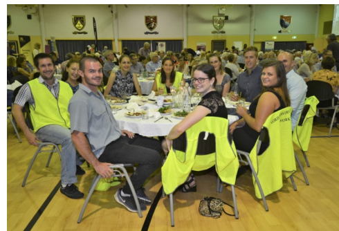
The Youth Ambassadors at the Kurt Fearnley Dinner.